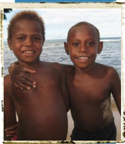
Papua New Guinean children on the island of New Ireland

When Melenda wrote our last prayer and praise update, Pat was checking scripture for some language groups in Papua New Guinea. These languages were all located on the island of New Ireland.