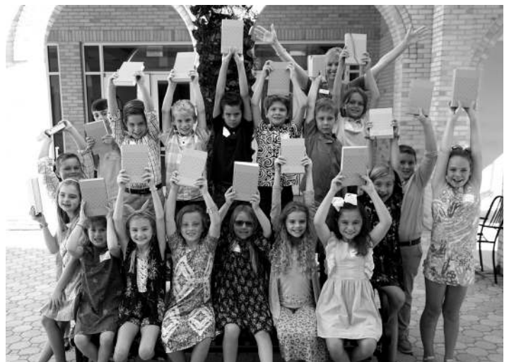
Third-Graders Receive Bibles, 2018